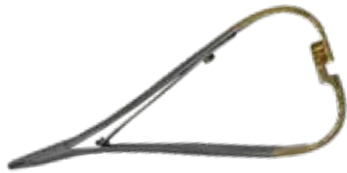
Mathieu Needle Holder, TC