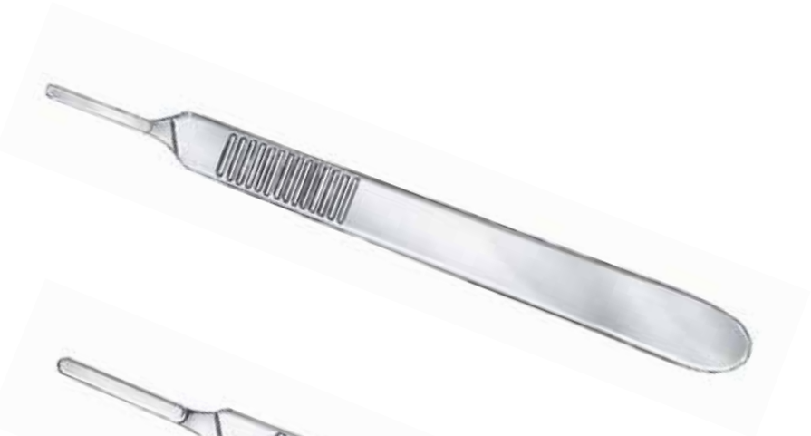
Scalpel Handle No. 4 Ref: 2041/0004