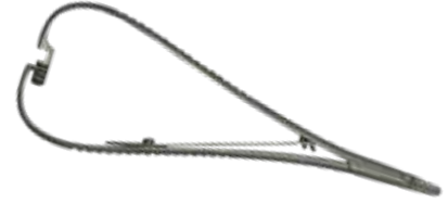
Mathieu Needle Holder