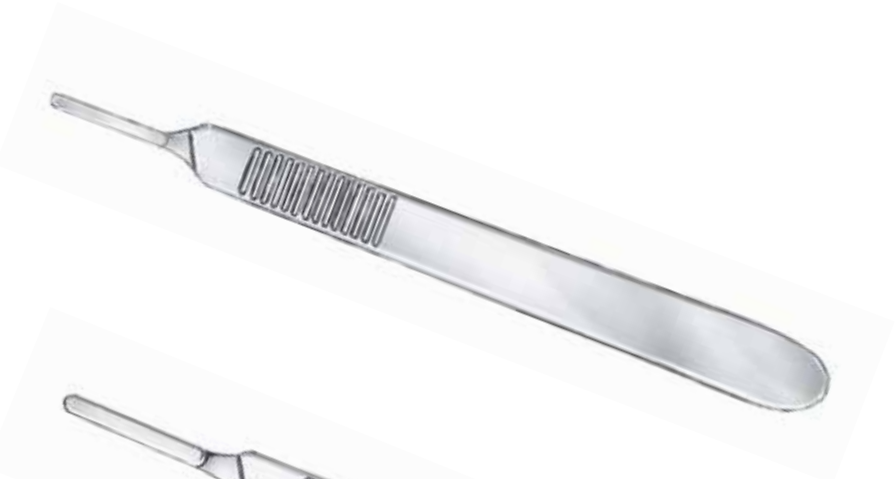
Scalpel Handle No. 4 Ref: 2041/0004