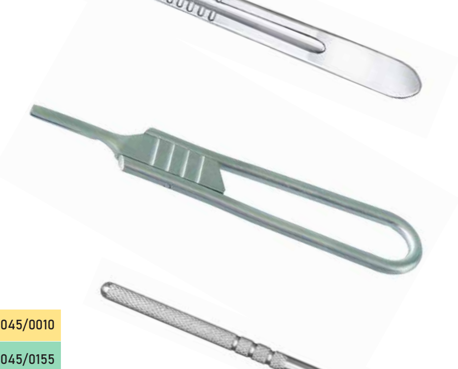
Scalpel Handle Beaver, 10cm(3.50") Ref: 2045/0010