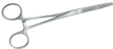
Olsen-Hegar Needle Holder