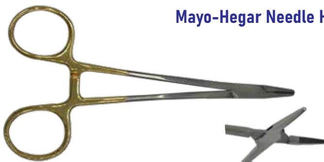
Mayo-Hegar Needle Holder, Straight