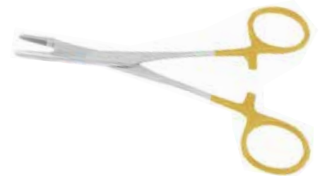
Olsen-Hegar Needle Holder, TC