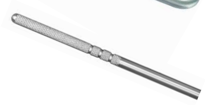
Scalpel Handle Beaver, 15.5cm(5.90") Ref: 2045/0155