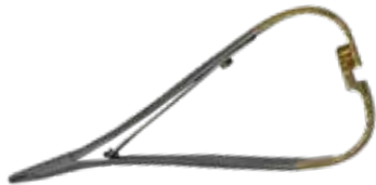
Mathieu Needle Holder, TC