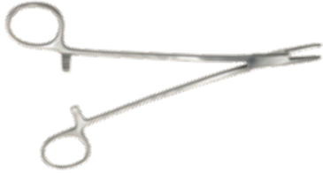
Mayo Needle Holder