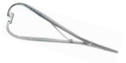
McPhalis Needle Holder